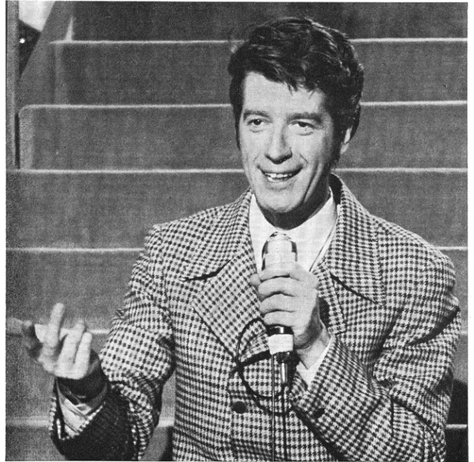
Rudi Carrell during one of his TV shows.